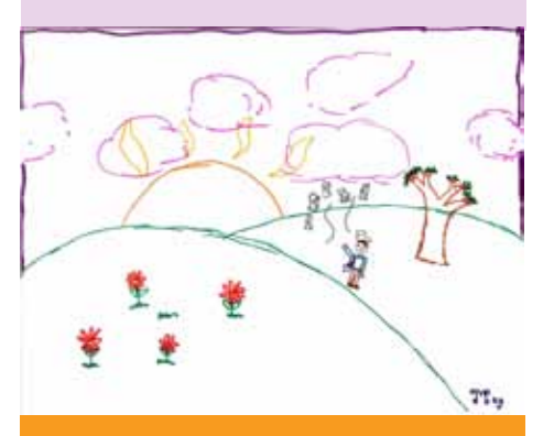
PO-4 Vancouver, BC

Thank you to the children at First Avenue School-Aged Program at the Glebe Parents Daycare Centre in Ottawa for the drawings.